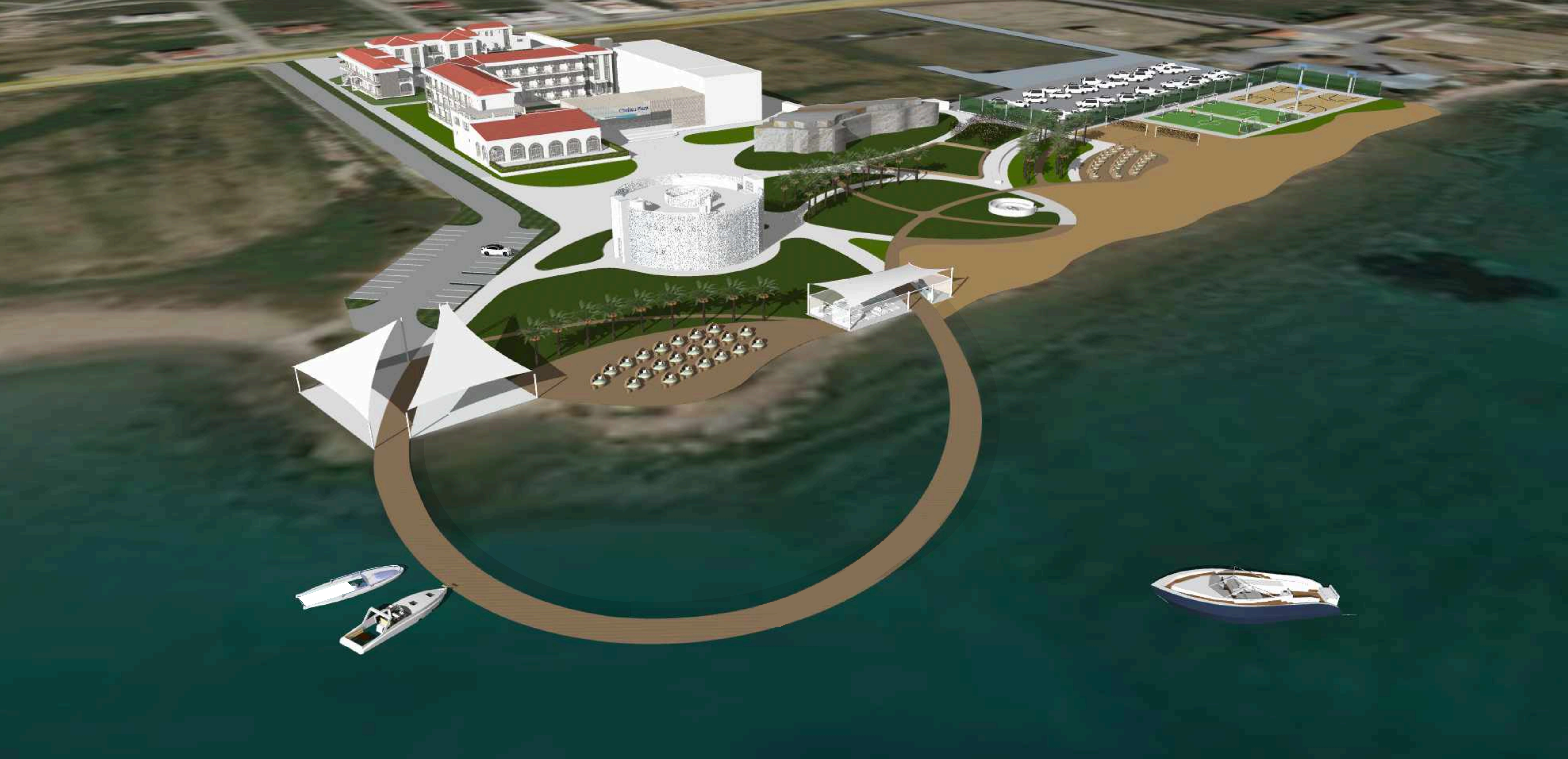
Small decked marina introduces a new access to the resort and extends one of the pathways into the sea, creating a perpetual walkway passing through the marina reception/ water sports centre and chill out beach bar on the other side