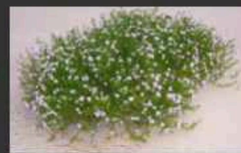
Sea Rocket (Cakile Maritima)