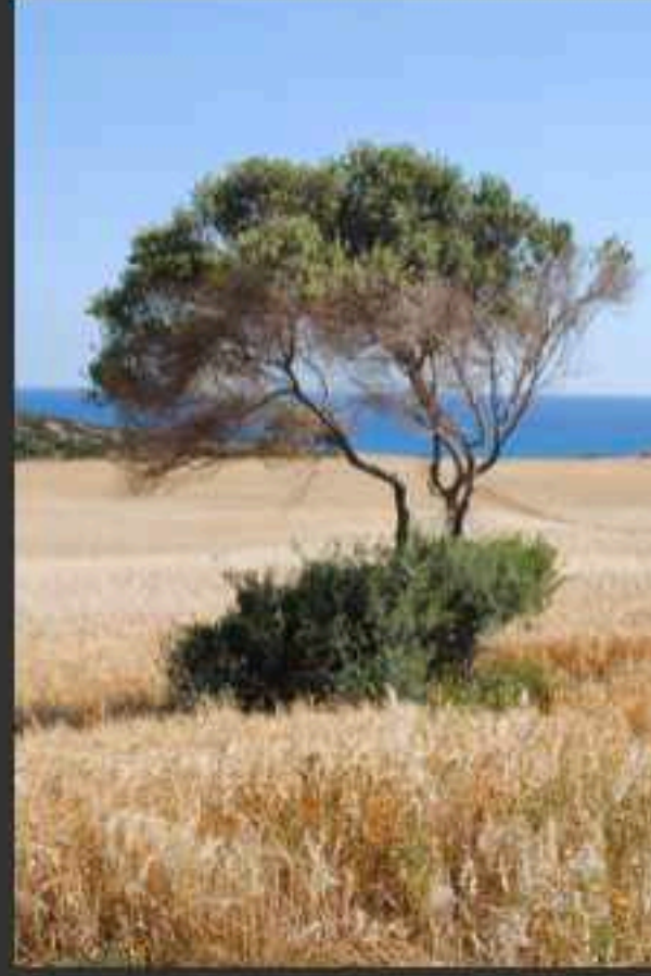
Wild Olive (Olea Europea)