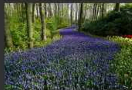
Sea Lavender (Limonium spp)

Halophyte plants are able to survive in and around land or water high in salt content.