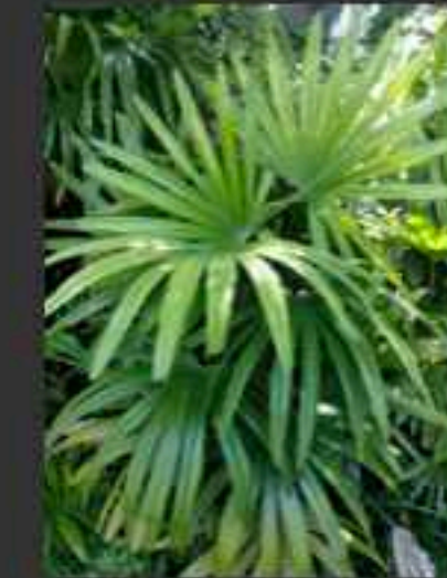
Lady Palm Tree