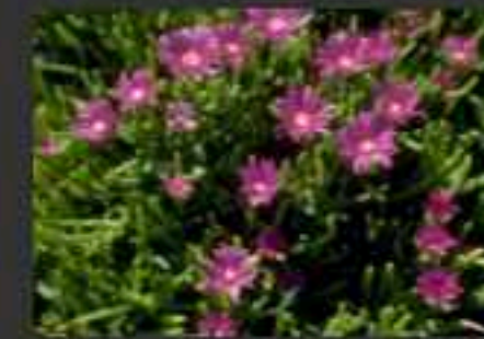
Ice Plant (Mesembryanthemum spp)